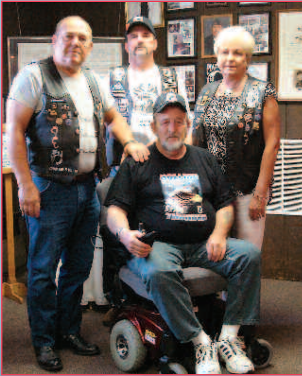
Rolling Thunder members across the country help veterans in need by donating wheelchairs...