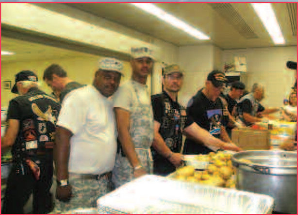
...serving at Stand Down events and countless other activities.

A 501(c)(3) charitable organization, Rolling Thunder Charities, Inc., was established to help American veterans and their families. It represents a tangible extension of the Rolling Thunder, Inc., mission: